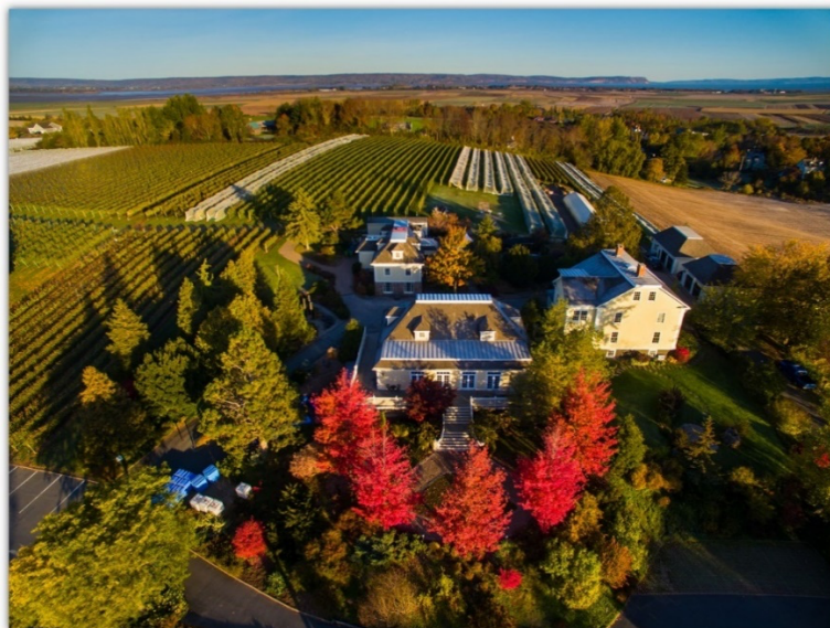
Grand Pré Winery in Nova Scotia

The four provinces of the region, New Brunswick , Nova Scotia , Newfoundland & Labrador , and Prince Edward Island each have their own news-worthy happenings in 2021. A 19-mile coastal parkway in New Brunswick is a road tripper's dream, while adventurous visitors can stroll around North America's first tree walk in Nova Scotia. Seafood lovers will find a slice of paradise at the 25 th Annual International Shellfish Festival in Prince Edward Island, and visitors can have a hands-on lesson in geological history at the Discovery UNESCO Global Geopark in Newfoundland & Labrador.