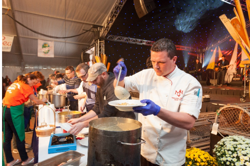
International Shellfish Festival in Prince Edward Island