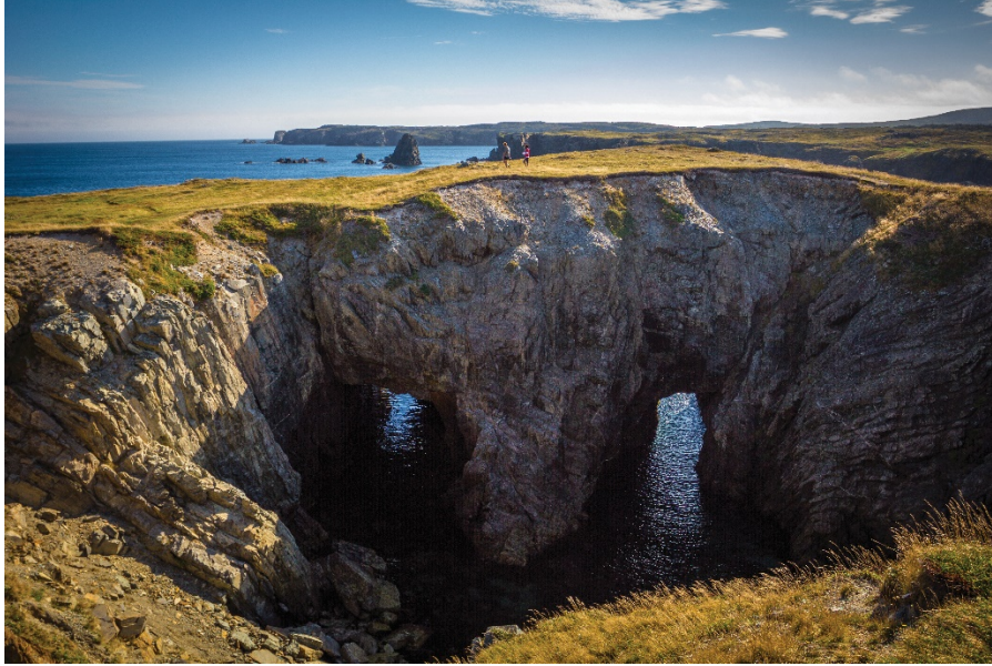
The Discovery UNESCO Global Geopark in Newfoundland & Labrador